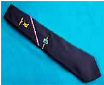
Association Tie (Members only) £11.50 UK £12.50 overseas