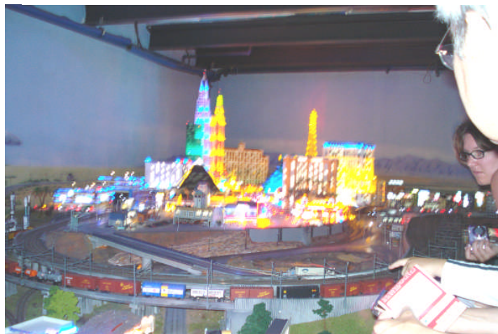
Hamburg August 2011 The “Miniature Wonderland” exhibition centre. Five floors of working models and scenery. The exhibition includes Alpine scenes complete with Mountains, cable cars and ski lifts.