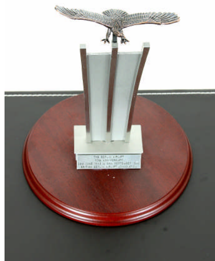
60th Anniversary BBAA Memorial Miniature Replica. It stands 9 inches high on a Circular wooden base. Made of matt and polished Pewter, with Bronzed Eagle And dated Anniversary Plaque at the base. £20.00 UK Plus £5.00 postage & Packing Overseas cost on application