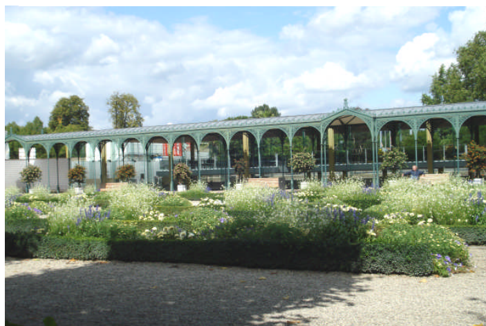
Hanover Sunday 28th August 2011. The famous Gardens at Herrenhausen The Gardens are easily accessed by tramcar from near the main Railway Station