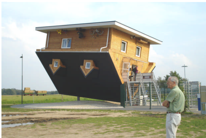
Bispingen near Soltau. The most unusual “Upside Down House” located at the new Theme Park. Nearby is the “Snowdome” with a ski-slope and lift