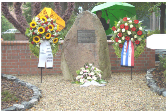
Fassberg August 27th 2011 The two wreaths commemorating the last flight to Berlin in August 1949. BBAW Wreath on the right.