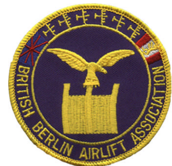
Cloth Badge (Members only) Large £2.00 UK £3.00 overseas Small £1.50 UK £2.50 overseas With magnetic clasp £3.00 UK £4.00 overseas