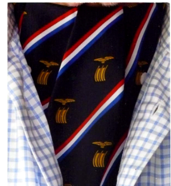
Cravat (Members only) £2.50 UK £3.50 overseas