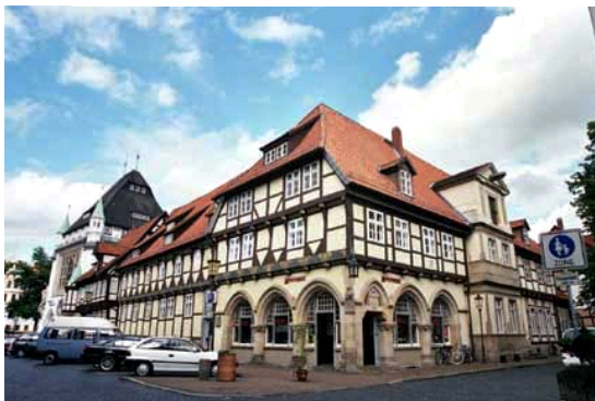
The Square and the Fountain