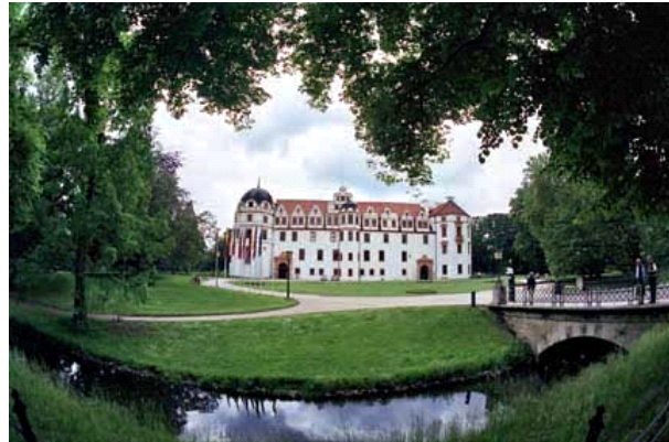
The Old Castle in the City Centre