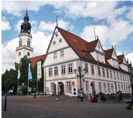
The Church and the Town Hall