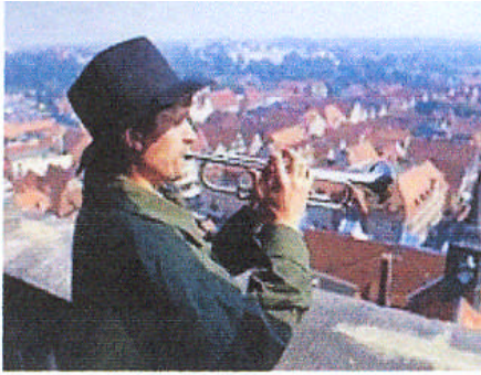
The Town Bugler plays twice daily