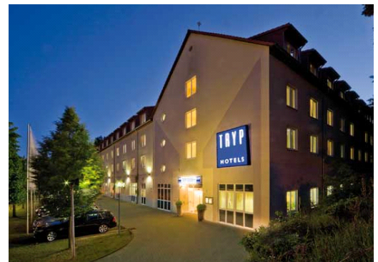
The Tryp Sol-Melia Hotel