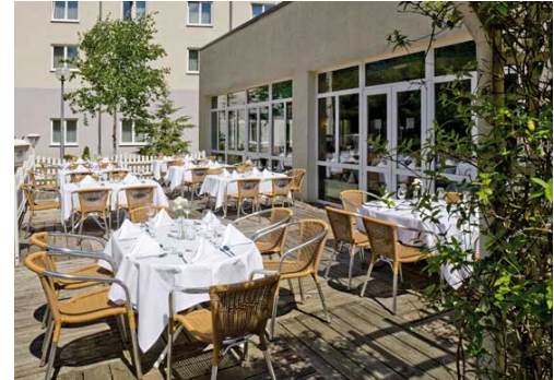
The outdoor Restaurant area

The city of Celle is in Lower Saxony Land (state), in north-central Germany, on the Aller River, at the southern edge of the Lüneburger Heide (Heath), northeast of Hannover. The old town, Altencelle, was founded about 1248, and Celle (founded 1292) was the residence (1371–1705) of the dukes of Brunswick-Lüneburg. The old town has many fine examples of 16th- to 19th-century half-timbered buildings, including the Hoppener Haus (1532) and the Grammar School (1603). The Parish Church (1308–1675) has the ducal burial vaults, and in the ducal palace (dating from 1292 and modified to baroque in the 17th century) is the oldest theatre in Germany still in use.