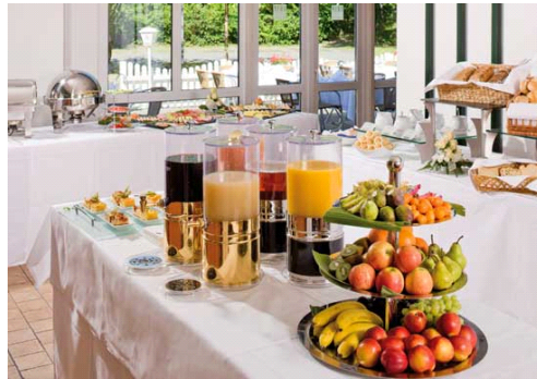
Part of the Restaurant