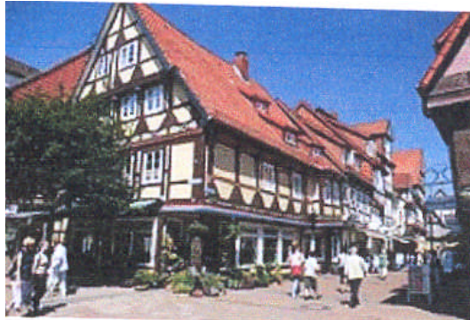
The buildings are typical of the city centre shopping area.